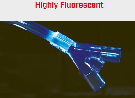
In Liquid and Cured State