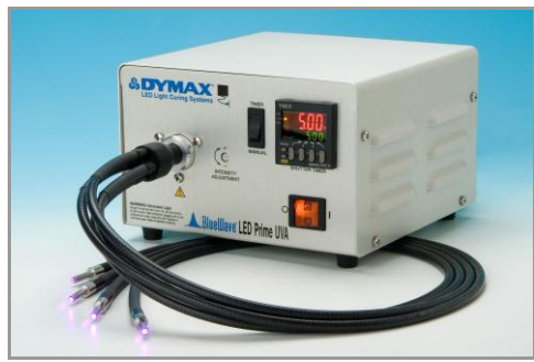
DYMAX BlueWave® LED Prime UVA Spot- Curing System Ideal for spot-curing small areas