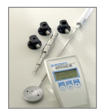
ACCU-CAL<sup>™</sup> 50 Radiometer for process monitoring.