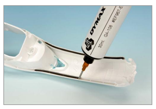
Dispensing a soft gasket into the groove of an appliance device to reduce vibration and create a water-tight seal.