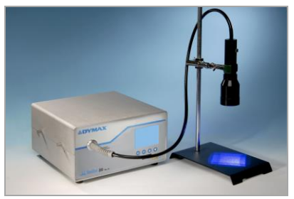
Rod Lenses Shown: BlueWave 200 with 8 mm rod lens (rod lenses require an 8 mm lightguide) 2" x 2" Area (~100 mW/cm²) PN 38699 5" x 5" Area (~30 mW/cm²) PN 38698