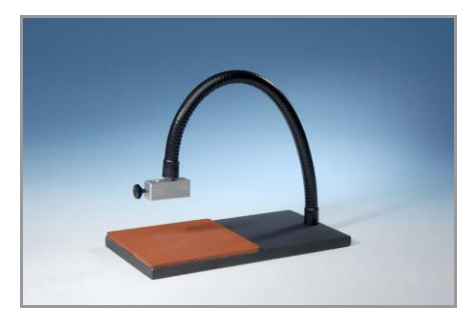
Lightguide Mounting Stand (fits 3 mm, 5 mm and 8 mm lightguides) PN 39700