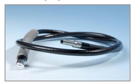
Liquid Lightguides available in 1-, 2-, 3-, & 4-pole configurations (see Table 1 on Page 3 for sizes and part numbers)