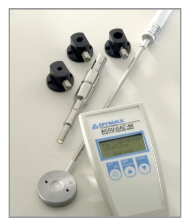
ACCU-CAL™ 50 Radiometer for measuring the UV intensity of spot lamps, flood lamps and conveyor systems PN 39560