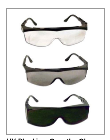
UV-Blocking, Over-the-Glasses Eye Protection Clear PN 35284 ■ Tinted PN 35285 Dark Tint PN 35286