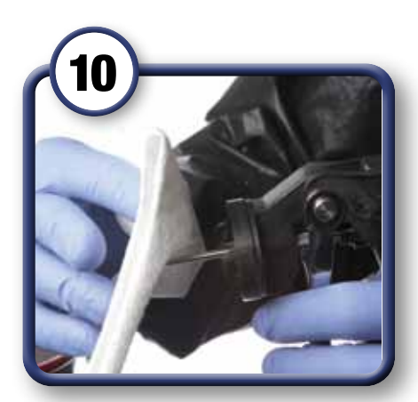
Wipe off any additional residue from the fluid needle.