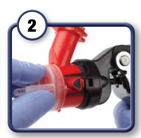
Attach an atomizing head to the gun - pull trigger back and hold, making sure the release buttons are aligned with latch openings - listen for a double click to ensure that it is fully engaged.