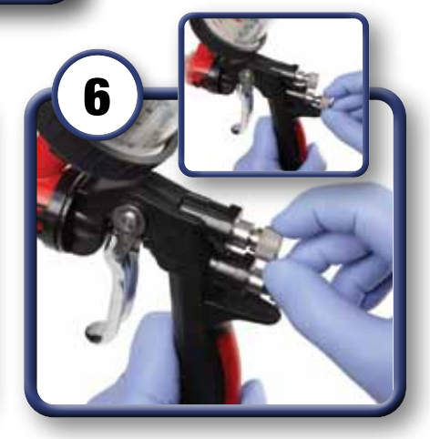
Adjust fan and fluid flow to achieve the desired size and wetness of the pattern. NOTE : when closing the fan adjustment completely it may be necessary to re-adjust the air flow control valve.