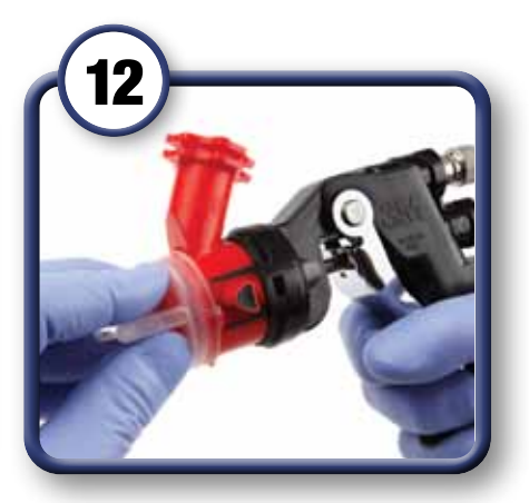
Re-attach the same atomizing head or when necessary replace with a new one.