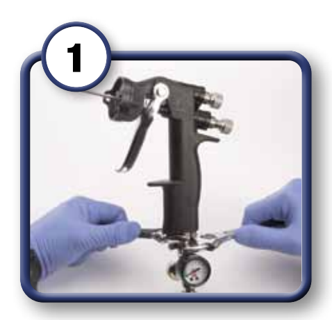
Hand tighten or use two wrenches to connect the air flow control value.

Get the finish of a premium HVLP gun at a fraction of the cost. Designed for those who demand the best and won't settle for less.