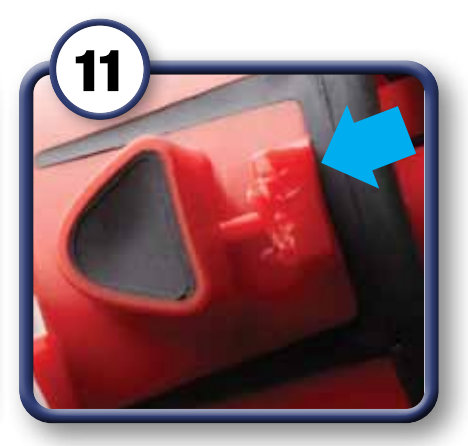
Inspect atomizing head for damage or wear which could result in fluid leaks or poor performance.