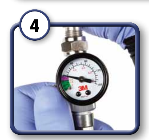
Set air pressure at 25 psi for 1st stage (only air flowing)