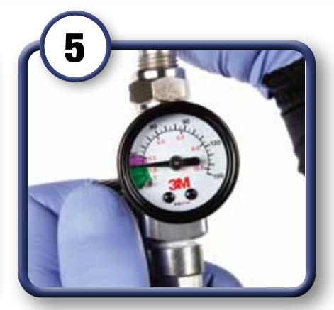
Set air pressure at 15 psi for 2<sup>nd</sup> stage (air and fluid flowing)