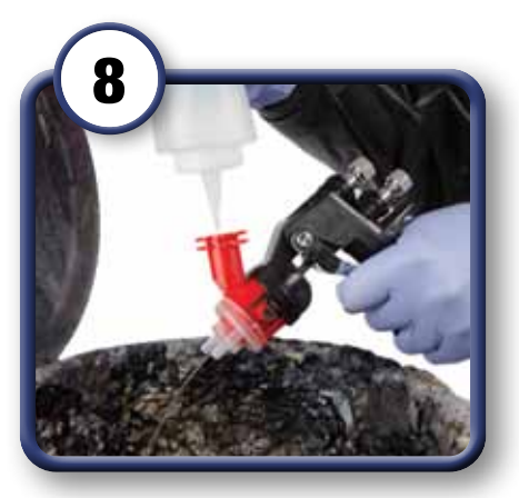
Flush out atomizing head with appropriate solvent until the atomizing head is clear of coating.