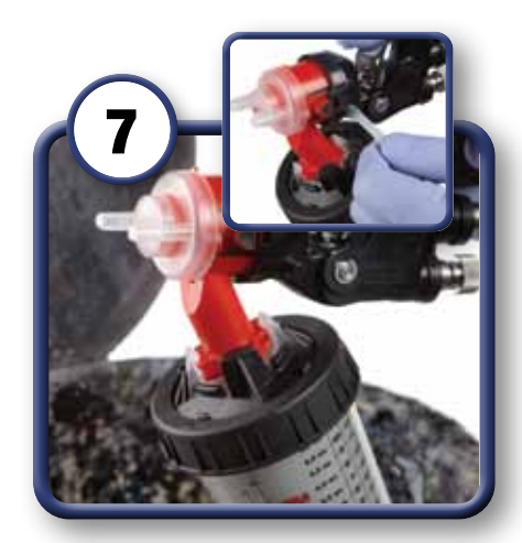
When you are finished using the system, pull the trigger back to release fluid back into cup, remove the air line, and the 3M<sup>™</sup> PPS<sup>™</sup> Cup.