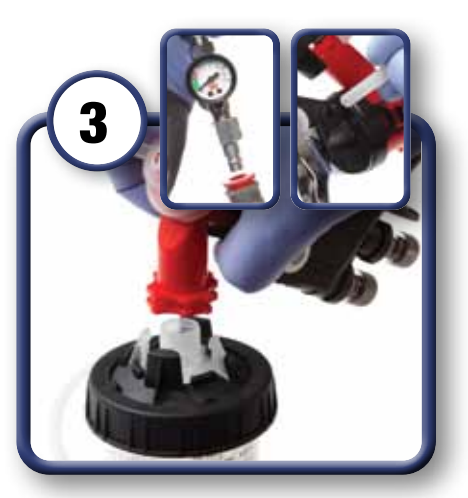
Attach 3M<sup>™</sup> PPS<sup>™</sup> cup filled with coating and attach compressed air hose.