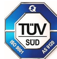
Greg Bates Director Business Assurance America Page 1 of 2

The certificate is valid from February 15, 2024 until February 14, 2027 with a re-issue date on N/A and a Certification Structure: Multiple Site